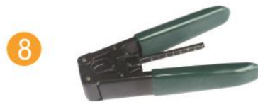
Drop Cable Stripper